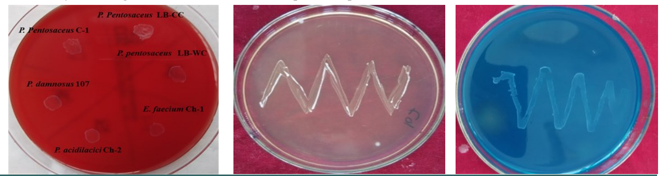
Figure 3 Haemolytic, Gelatinase and DNase activity of Enterococcus faecium Ch-1

Safety assessment with regard to hemolytic potential is an essential phase in the selection of Enterococci as potential probiotics (Fig.4). E. faecium Ch-1 showed no positive hemolysis, DNase and gelatinase enzyme activities, thereby revealing its safe status and its use as potential probiotic candidate.